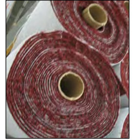
This carpet is made of 100% recycled fibers.

cardboard signage along with other cardboards. Ask your general service contractor about green options! ▼