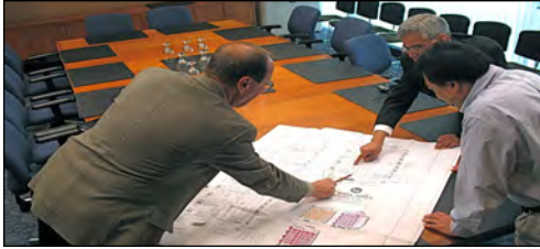
Set green goals and share with partners early.

SF has developed green purchasing catalogue, SFAApproved.org over the past five years to serve as a resource for other cities as well as for corporate purchasing agents and consumers and lists over 1,000 products that do not emit greenhouse gases. Available 24 hours a day!