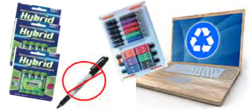
Find green office supplies on SFAApproved.org ▶