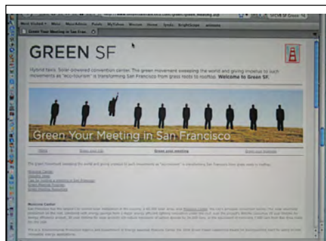
SFCVB's Green Meetings Program highlights services like green transportation. Click here >

Share your green goals with your partners. This helps everyone to plan ahead