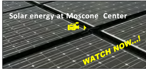
Download green promotional videos, PDFs