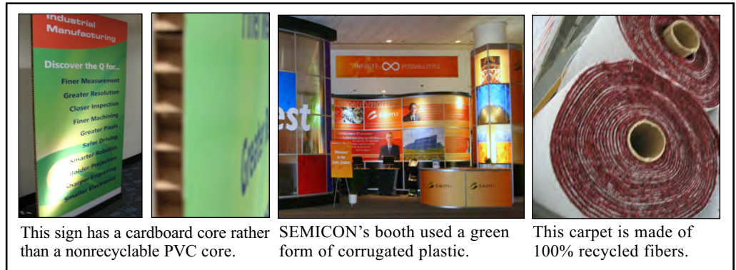
This sign has a cardboard core rather than a nonrecyclable PVC core.

Carpet has always been cleaned and reused. Now it is available with recycled