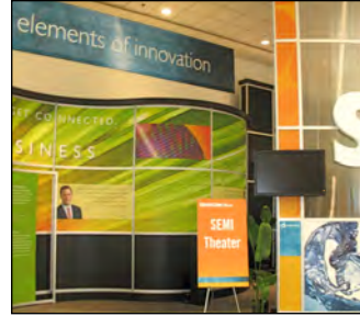
SEMICON's booth used a green form of corrugated plastic.