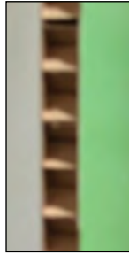
Honeycomb / corrugated cardboard sign board is 100% recyclable. We bale