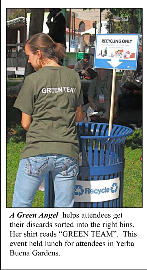
A Green Angel helps attendees get their discards sorted into the right bins. Her shirt reads "GREEN TEAM". This event held lunch for attendees in Yerba Buena Gardens.

To help you, the following service providers have been identified by the City to assist with recycling and composting at events. ♡