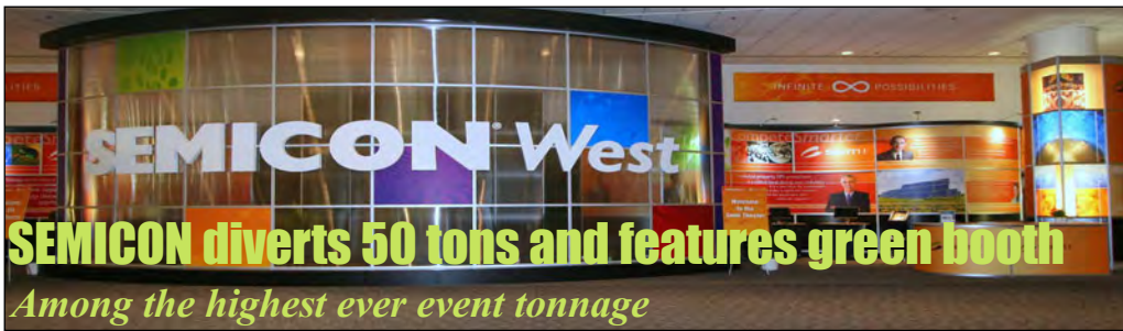
Photo top left: SEMICON's green booth in the North lower lobby, Download the Planner's Green Guide. ▼