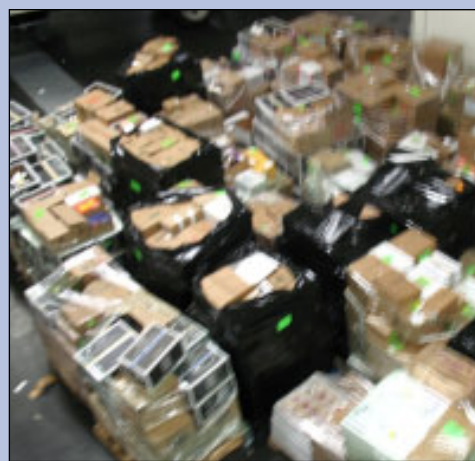
Pallets of donated food await delivery in Hall D.